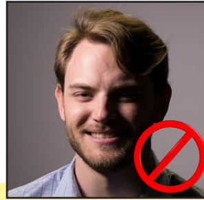
Face in Shadow

There are shadows on the face and background.